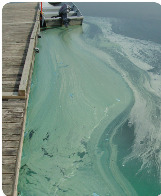
Blue-green algae thrives in warm, shallow, slow-moving water. Blooms are commonly found near docks and shoreline areas.

The Ontario Drinking Water Quality Standard for microcystin-LR (a common algal toxin) is a maximum acceptable concentration of 1.5 micrograms per litre, which is the same as 1.5 parts per billion. It is rare for treated water tests in Ontario to exceed this standard, but precautions should still be taken when a bloom occurs.