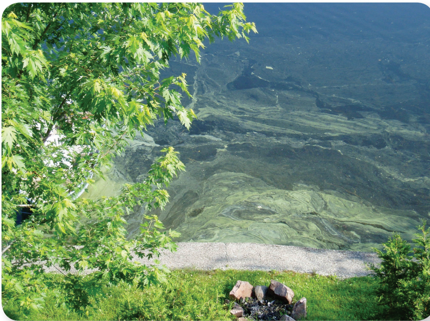
Colonies of microscopic blue-green algae appear on a lake during a bloom. Blooms occur mostly during late summer and early fall.

Human activities can promote the growth of blue-green algae. For instance, agricultural, urban and stormwater runoff, effluent from sewage treatment plants and industry, and leaching from septic systems can elevate the levels of nutrients in water bodies, which can promote algae growth. Reducing or eliminating nutrient inputs from these sources is a proactive way to reduce the occurrence of blue-green algal blooms.